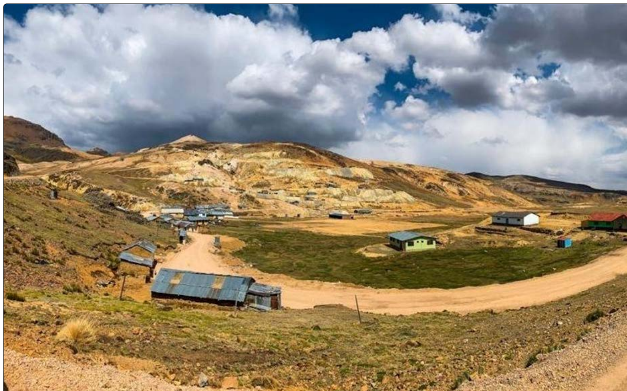
Image 1: Photograph of the Bethania mine site in Huancavelica, Central Peru

On the 19th of June 2025, Silver Crown Royalties signed an LOI with Kuya Silver for a 4.5% royalty on silver produced from its Bethania Mine in Central Peru. The proposal envisions a US$3 million cash payment and a US$2 million payment in shares at a unit price of $6.50 per share, or the 5-day volume-weighted average price before closing. The share component includes a half warrant for each share issued, with a duration of 3 years and a strike price of $13.00. If the agreement is concluded, SCRI will receive 4,500 ounces of silver in the first four quarters following the closing of the deal, 9,000 ounces in the subsequent four quarters, and 12,375 ounces from the 9th to the 40th quarter. Once Kuya Silver has delivered 475,000 ounces, the royalty will be reduced to 1% of the silver produced.